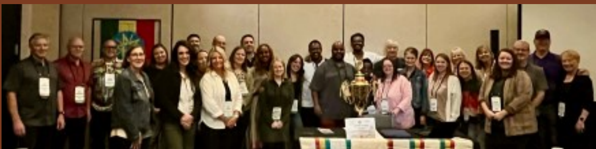
Pictured: Ethiopia In-Country Staff + Some of the U.S. Partners

That's the best way to describe this experience filled with love, joy and beautiful connection. God's global family from Guatemala, Uganda, Ethiopia and the U.S. gathered together. All for the purpose of furthering God's Kingdom by lifting up and empowering the most vulnerable of His children. A thin place indeed! Hope is alive! Rest assured...your support of our friends at the Chapa CarePoint in Ethiopia is God inspired!